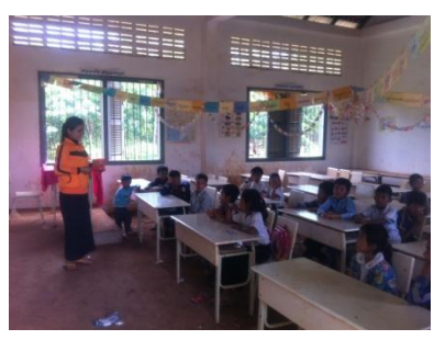
Fig.5 (Oral Health Education by Teacheer at Pou Chrey PS)