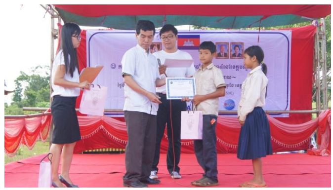
Fig.12 (Reward for Good Oral Health Condition)