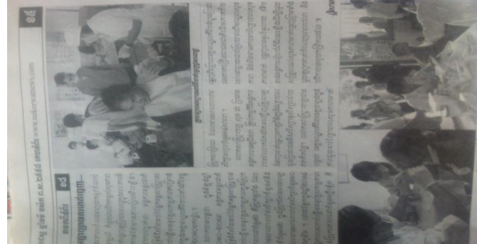
Fig.13 (Happy Smile Post on Nokorwat Newspaper