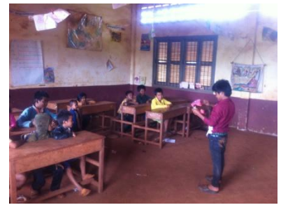
Fig.2 (Oral Health Education by Class-monitor at Pouchrey Chang PS )