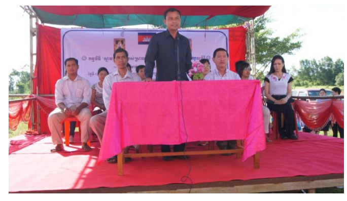
Fig.08 (Opening Remark by Vice District Governor)

As result, there are 315 people receiving oral health education, 85 filling, 125 extracting and 255 screening.