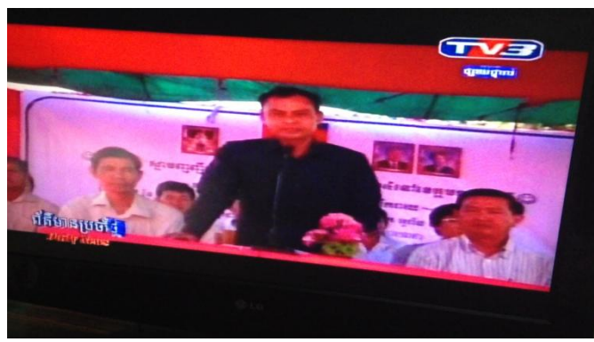
Fig.13 (HPS Broadcast on TV3)