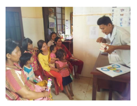
Fig.07 (Oral Health Education to Villager by Krang Tes HC Officer)

After OISDEC staff provided Oral Health Education by flipchart to HC staff, we have flexible schedule to follow-up their oral health education at each health center!