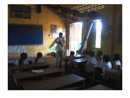
Fig.6 (Education by Principle at Pou Chou PS)